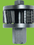
"H" TYPE for Cleaning straight and curved tube