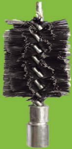
"DS" for removing light scale and burnishing all types of tube