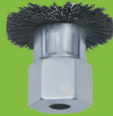
"TH" for soot removal from smoke tube, general cleaning